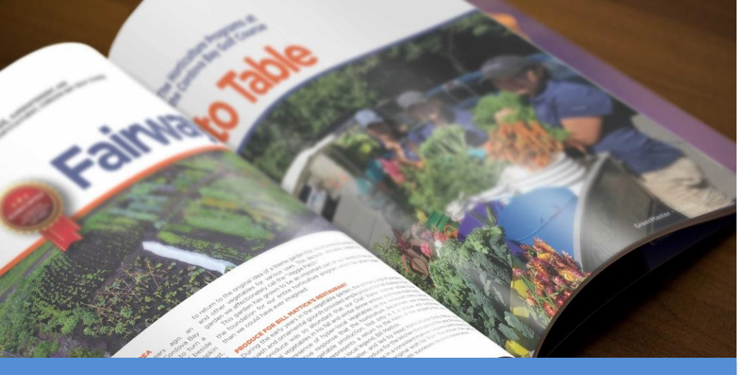
GreenMaster/Golf Business Canada