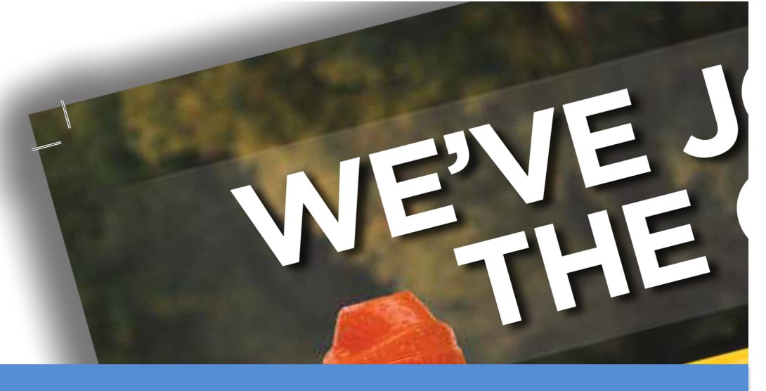
GreenMaster/Golf Business Canada